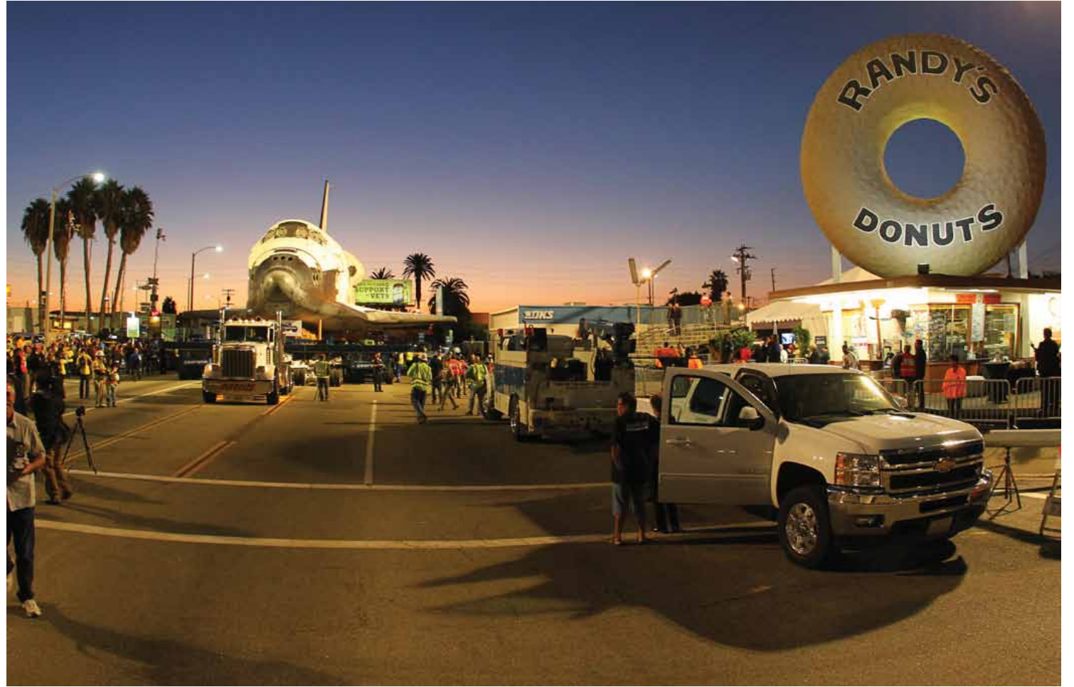
The city of champions welcomed space shuttle Endeavour as thousands gathered to watch the orbiter make its 13-mile voyage to the California Science Center at Exposition Park. Seen here The Space Shuttle Endeavour prepares to shoot a Toyota commercial at the 405 overpass bridge near Randy's Donuts.